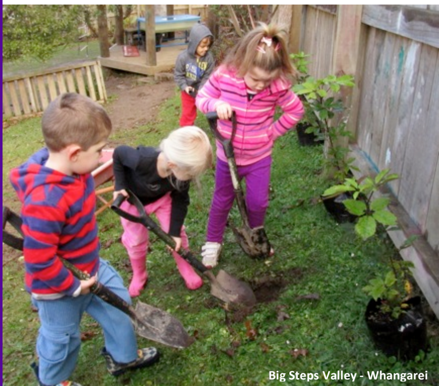
Big Steps Valley - Whangarei