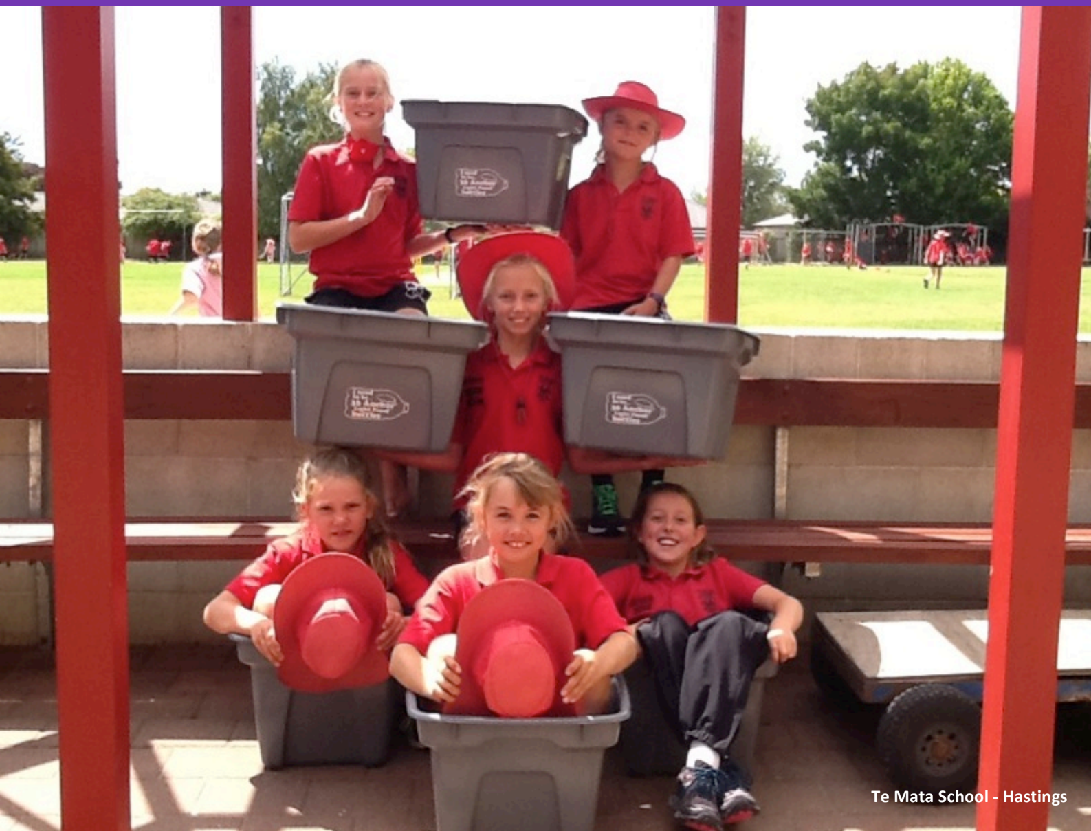
Te Mata School - Hastings