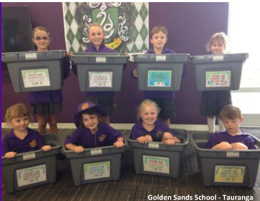
Golden Sands School - Tauranga