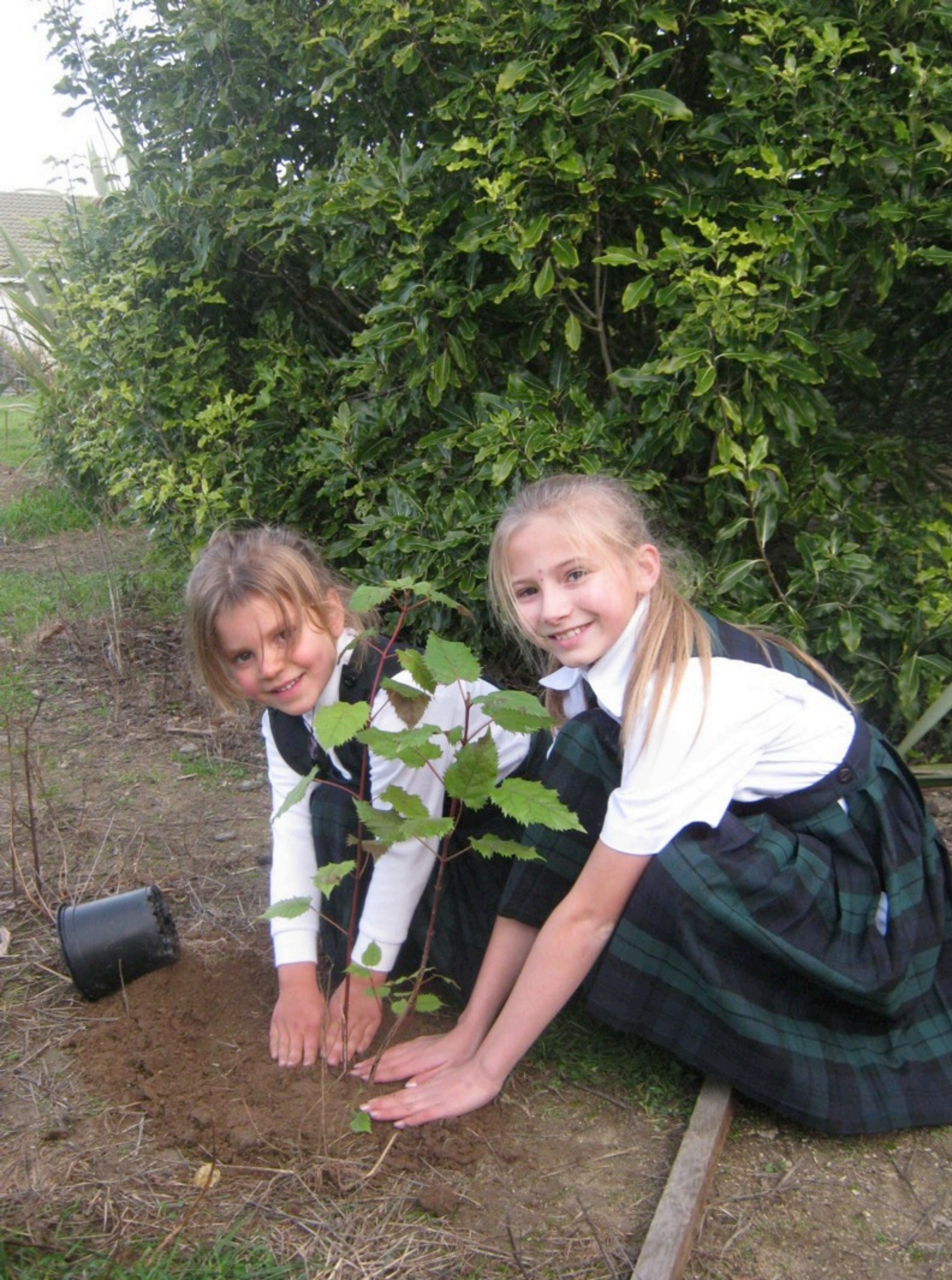
Students from St Patrick's School in Masterton planting their Paper4trees earnings.