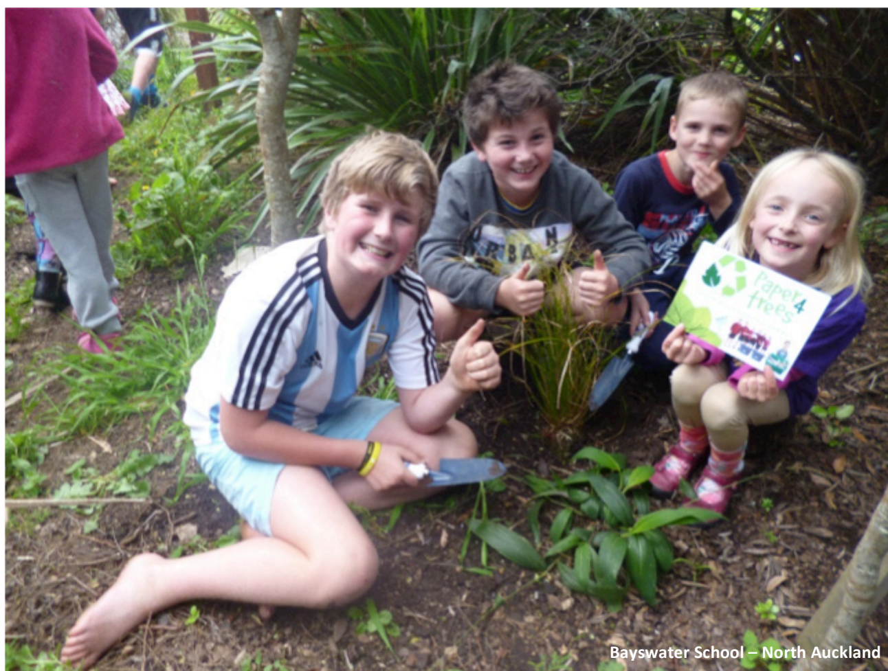
Bayswater School – North Auckland