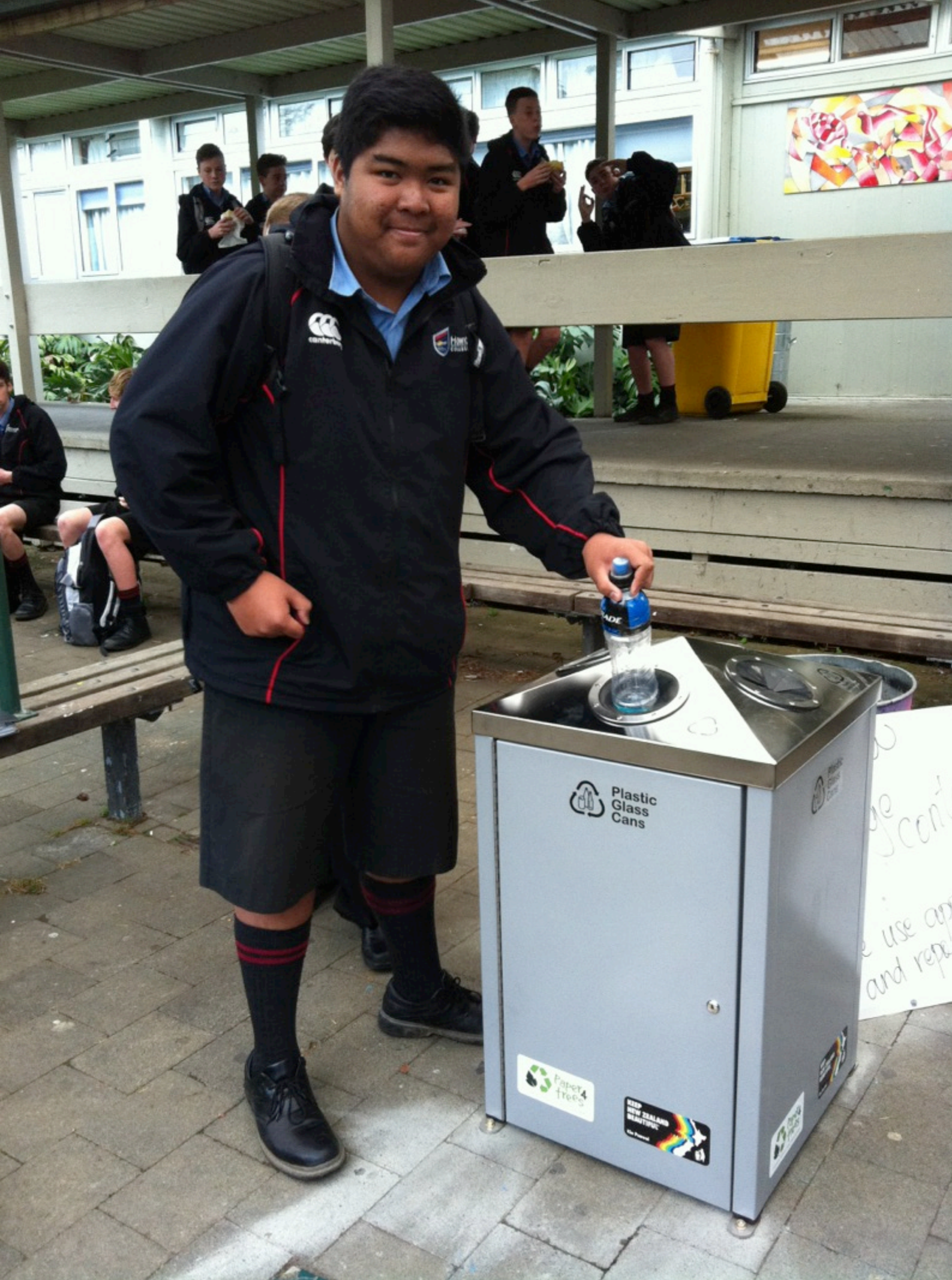
Howick College – Keep New Zealand Beautiful Beverage Container Recycling Project